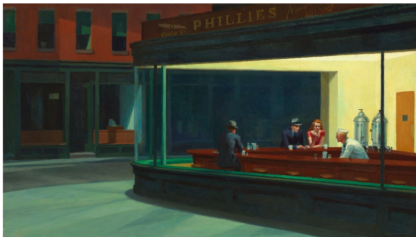
Fig. 3. Edward Hopper's 1942 oil on canvas painting Nighthawks . Despite the emergence and mainstream success of abstract expressionism, Hopper held on to American Realism.

Continuing Kingdom Come 's approach to integrate postmodernism, thereby reaffirming the heroic myth, Grant Morrison and Howard Porter launched JLA , a reboot of Justice League of America which itself is considered a mainstay of Silver Age comics, in 1997. Commercially, JLA was the most successful reconstruction as it became DC Comics' best-selling title in the late 1990s. It unites DC's seven most popular heroes, namely Superman, Batman, Wonder Woman, The Flash, Green Lantern, Aquaman, and Martian Manhunter, fighting cosmic threats. This back-to-basics approach with the group's core members from the early 1960s in the Watchtower, their Moon-based headquarters, fighting interstellar, cross-dimensional, and supernatural threats instead of the (pseudo-)authenticity of organized crime, political corruption, and personal tragedies characteristic of the 1980s and early 1990s, heavily