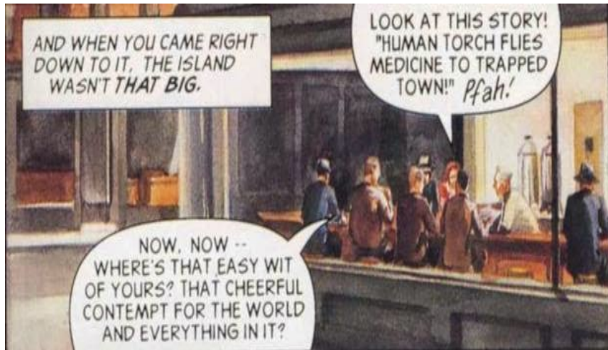
Fig. 2. Panel from Marvels referencing Edward Hopper's Nighthawks . Art by Alex Ross, written by Kurt Busiek (n. pag.).

Rockwell's illustrations, Silver Age comics represent popular art considered inferior to their "high art" counterparts. Referencing and therefore implicitly identifying with Edward Hopper and Norman Rockwell also suggests that Alex Ross is actively rejecting the postmodernist art of Bill Sienkiewicz and Dave McKean, his critically acclaimed contemporaries.